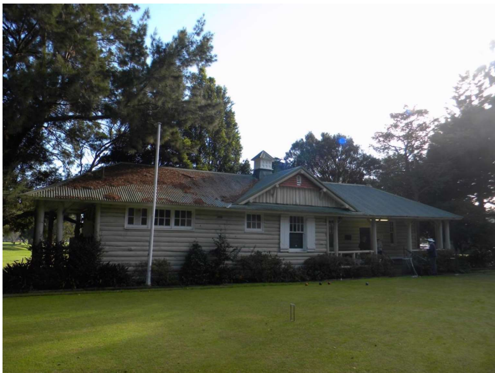
Figure 1: Sydney Croquet Club, southern elevation

The subject site is not listed on the NSW State Heritage Register (SHR), nor is it identified as a local heritage item or located in a heritage conservation area in Schedule 5 of Woollahra Local Environmental Plan 2014 (Woollahra LEP 2014).