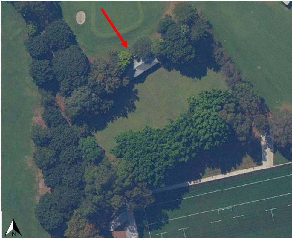
Figure 4: Aerial photograph over the clubhouse and lawns with club house indicated with arrow

The Rose Bay Scout Hall (Figure 5) is located at No. 3 Vickery Avenue, Rose Bay (Figure 6). The site is identified as Lots 1536 and 1537 D.P. 40022 and Lot 1475 D.P. 752011.