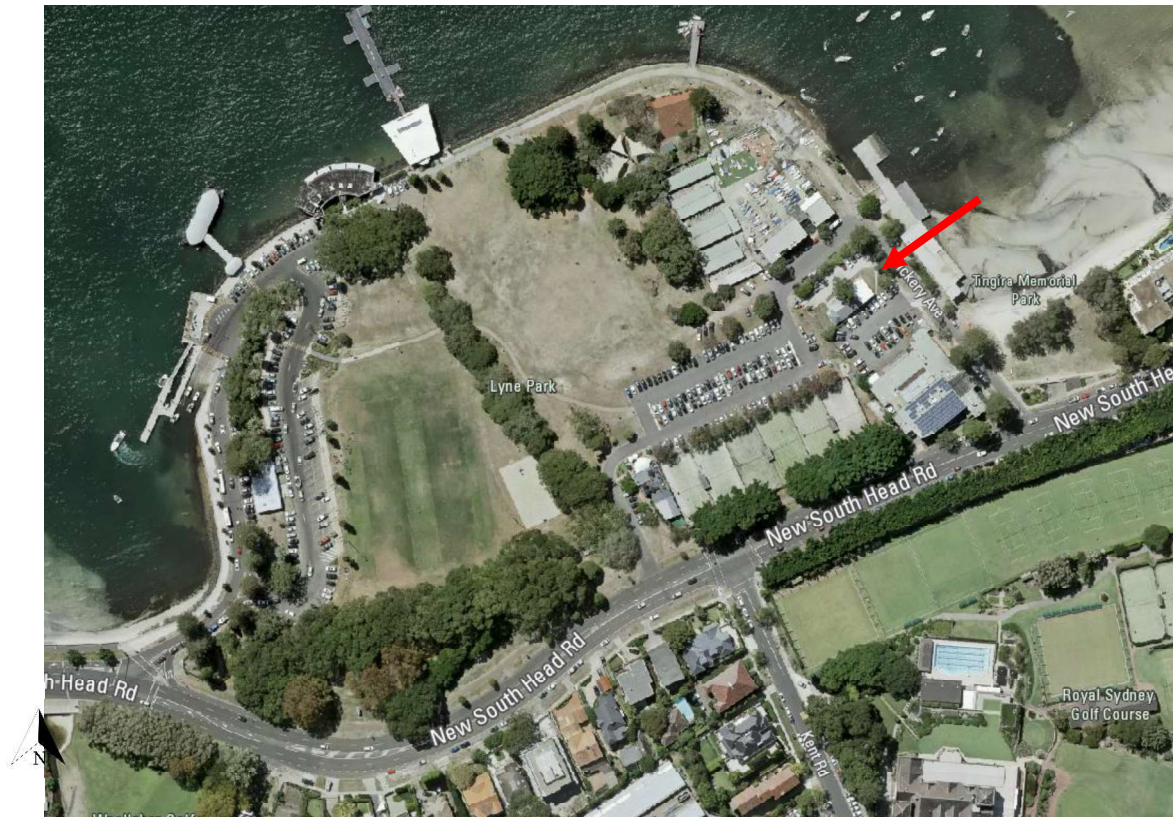
Figure 6: Site location. The arrow points to the site