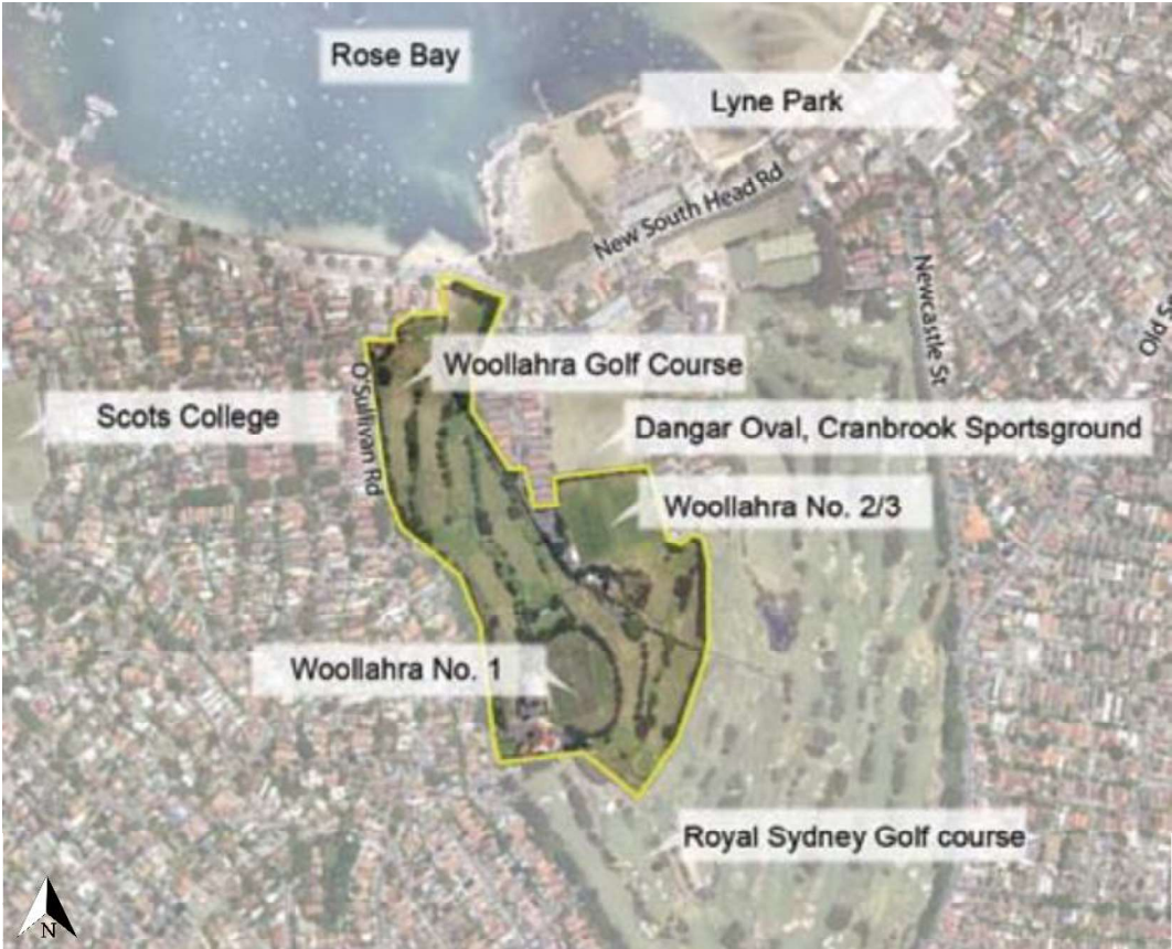
Figure 2: Location of Woollahra Park within Woollahra (Woollahra Park Plan of Management)