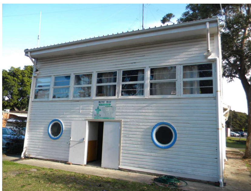
Figure 5: Rose Bay Scout Hall, front (north-eastern) elevation

The subject site is not listed on the NSW State Heritage Register (SHR), nor is it identified as a local heritage item or located in a heritage conservation area in Schedule 5 of Woollahra Local Environmental Plan 2014 (Woollahra LEP 2014).