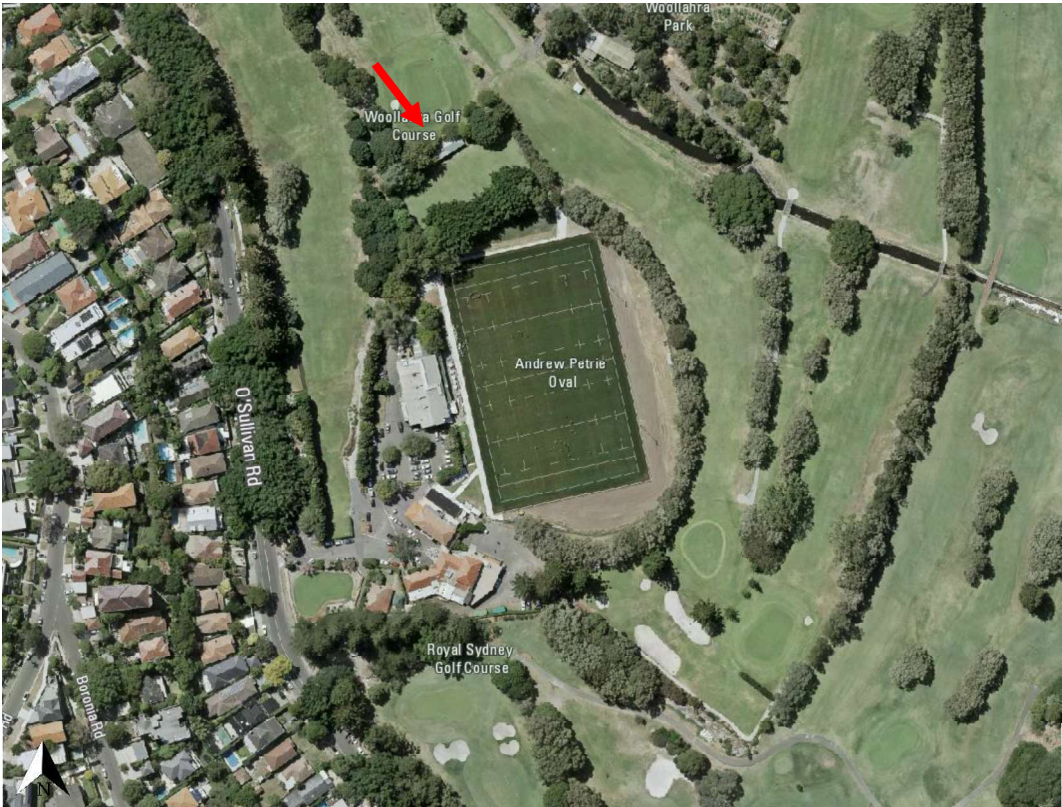
Figure 3: Location of the Croquet Club within Woollahra Park with Croquet Club indicated with arrow (Woollahra Council GIS)