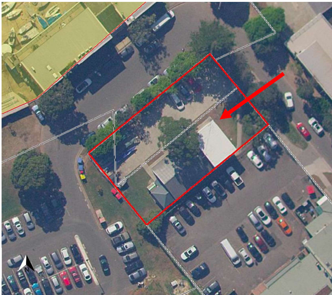
Figure 7: Aerial photograph over the site with Scout Hall indicated by arrow (SIX Maps; annotation by WP Heritage and Planning)